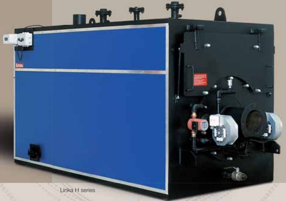
Linka H series