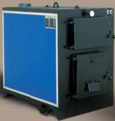
Linka 70-93 series